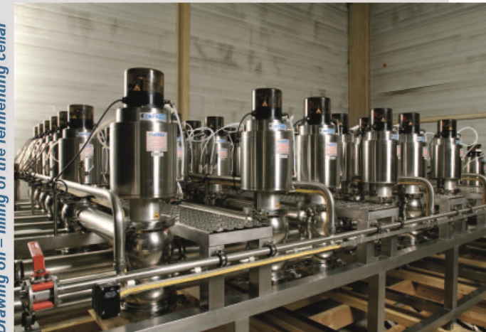
Drawing off – filling of the fermenting cellar